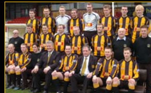
A new era - Berwick Rangers F.C. 2009

There are no miracle solutions for transforming Berwick Rangers, unless the club pulls off a plum cup tie against the Old Firm. To build on the renewed sense of optimism around the club, the Trust will have to work closely with the other members of the consortium and step up a gear in its fundraising and other activities. These are difficult times in the wider Borough, with job losses mounting and low wages. We need to be innovative about the way that we ask people to pay to watch Berwick Rangers and involve the wider community in the football club. We've already come up with some new ideas and these will be considered as part of a more professional approach to running the football club. Keep believing - we'll get there in the end, and if you think you can lend a hand, don't be shy about coming forward.