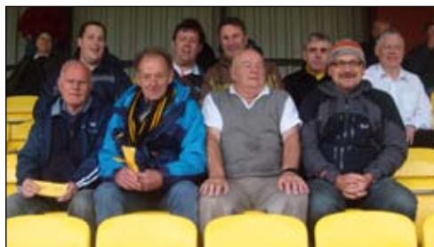
Members of the Supporters Trust and our friends from the Supporters Club.