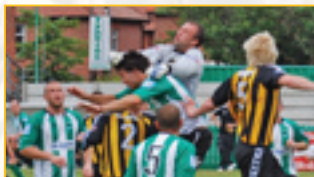
Our pre-season preview