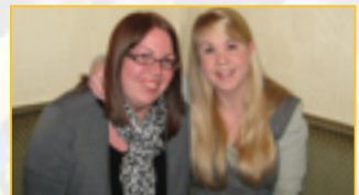
New board members