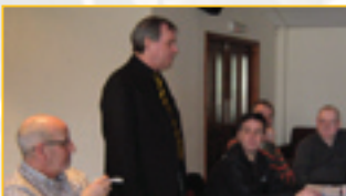
Trust AGM 2010