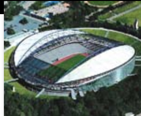
The Zentral Stadium

The final day (Sunday) was remarkable. A two hour drive south to Leipzig for the 4th Division (south east) match between Sachsen (Saxon) Leipzig and Dresden Nord. The match took place in the Zentral Stadium which was used