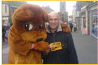
Our big-eared friend with a fan who had travelled from Seattle to watch Berwick v Arbroath