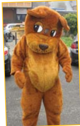
Our Trust bear all set to spread the word!