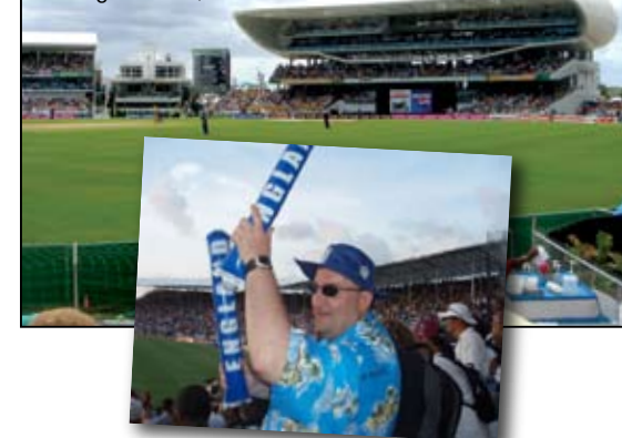
Kensington Oval, Barbados

No sleep, then up to watch the Toon play Chelsea at 8.30am, football in these parts are no good for those who like a lie in. More celebrations follow back at the hotel with the full repertoire of songs being sung, then of all things a complaint about the songs, only tongue in cheek though as it turns out the couple is from, of all places, wait for it, ARBROATH. All that way and meet some Smokies. He then comes up with the most ridiculous question ever - "did Arbroath win?" After some cheeky comments about anything and everything he walked away knowing full well who the champions were. End up managing a Cricket team Mango Bay Blasters who are playing a St Peter's Parish Select containing Pedro Collins (he is touring England with the West Indies this month) in a supposed friendly cricket match.